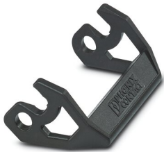
Replacement plastic single locking latch, for HC-EVO-D25.....BK housing

Please be informed that the data shown in this PDF document is generated from our online catalog. Please find the complete data in the user documentation. Our general terms of use for downloads are valid.